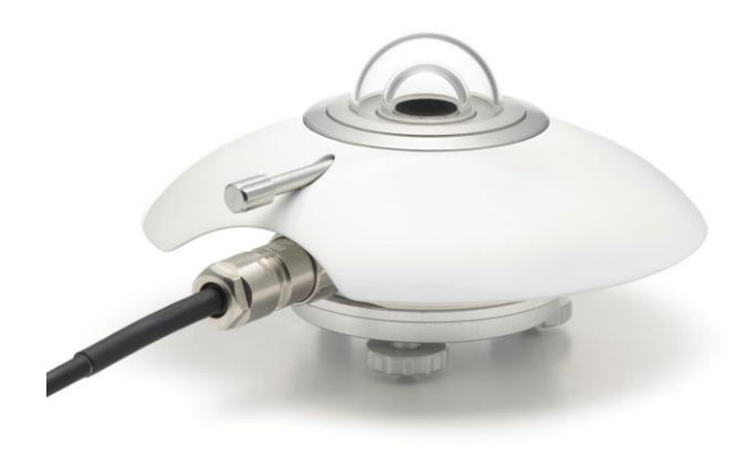
Figure 1 SR20 secondary standard pyranometer; also employed for sunshine duration measurement

NOTE: the fact that a sensor is used in a network does not constitute a formal endorsement by the network owner.