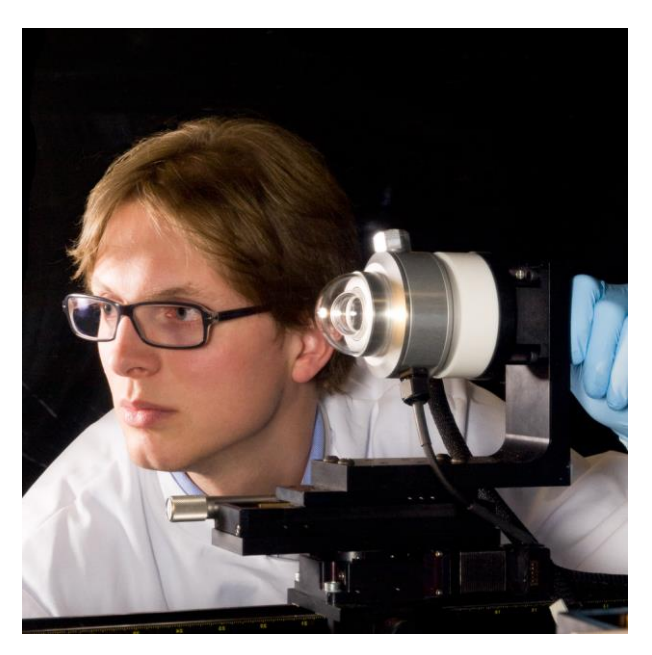
Figure 4 Calibration systems are also commercially available

Hukseflux provides indoor calibration equipment for pyranometers (indoor calibration according to ISO 9847, Type IIc). Advantages of this product: suitable for all pyranometer models, operation in a normal laboratory environment (no darkroom required), small area footprint and no need for additional air-conditioning (all lamp power is led outside with forced ventilation).