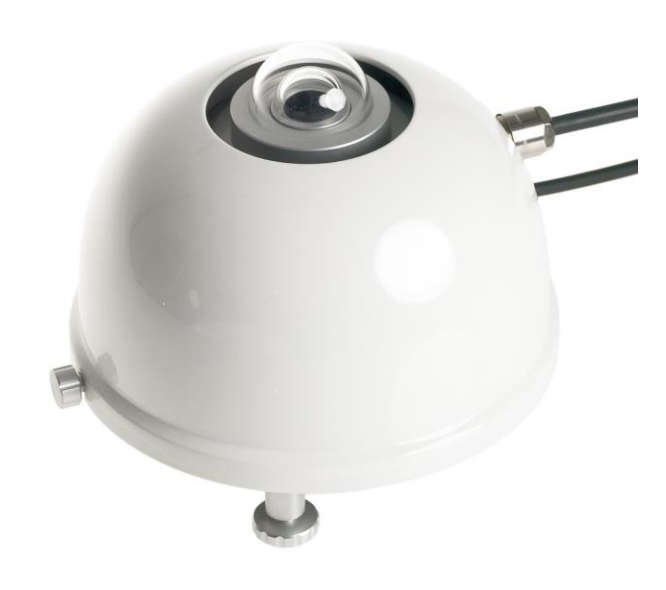
Figure 3 VU01 ventilation unit with SR20 pyranometer