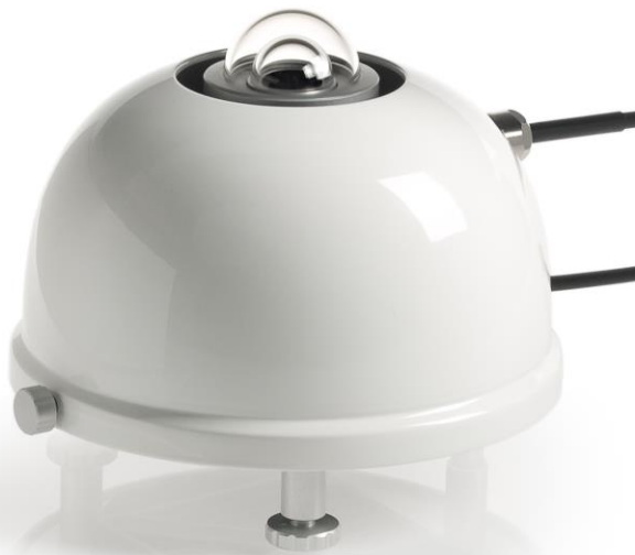
Figure 1 VU01 ventilation unit with pyranometer SR20

VU01 is a high-quality ventilation unit for use with pyranometers and pyrgeometers. Its purpose is to improve the dependability of the measurement. Measurement accuracy improves because offsets are reduced. Reliability benefits from prevention of dew and frost formation and quick evaporation and sublimation of water and snow. ISO/TR 9901 "Solar Energy - Field Pyranometers - Recommended practice for use" recommends use of ventilators where high accuracy and reliability are required.