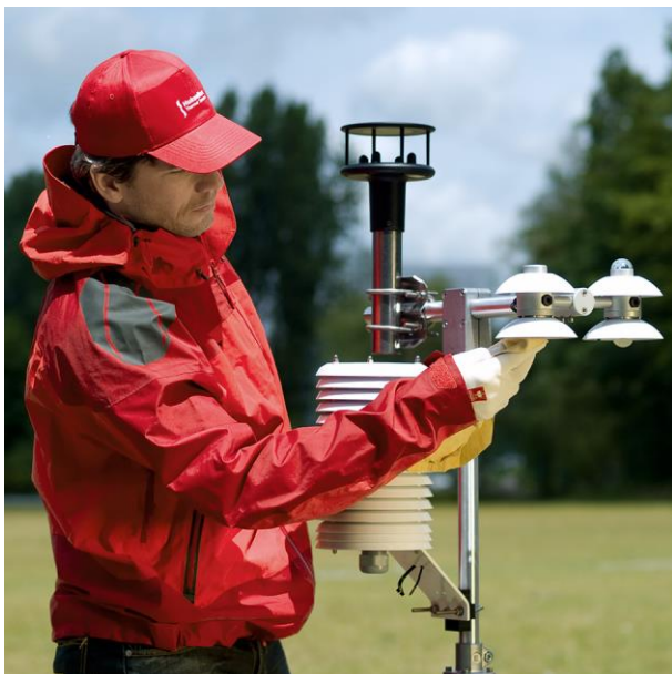
Figure 2 TP01 is typically used in high-accuracy surface flux measurement stations