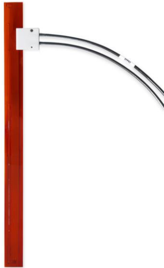
Figure 5 STP01 soil temperature profile sensor which is often combined with TP01 for soil energy budget calculation.

Hukseflux has equipped several testbeds in the electrical power industry, to monitor dryout, thermal runaway and thermal stability around mockup high-voltage power lines. Here the capability to perform a crude measurement of thermal diffusivity is an important feature, for modelling behavior under dynamic loads.