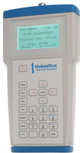
Figure 3 TNS02: CRU02 allows users to control the measurement using the keyboard and LCD display. Results are stored in CRU02's memory.