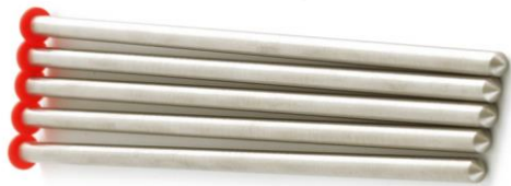
Figure 4 GT03 guiding tubes for use with TNS02.