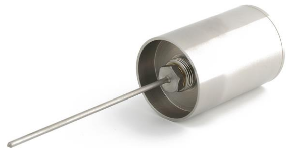
Figure 2 TNS02: Thermal needle TP07 with insertion tool IT03 for laboratory analysis of soil specimens. TP09 and lance LN02 are used for on-site measurements.