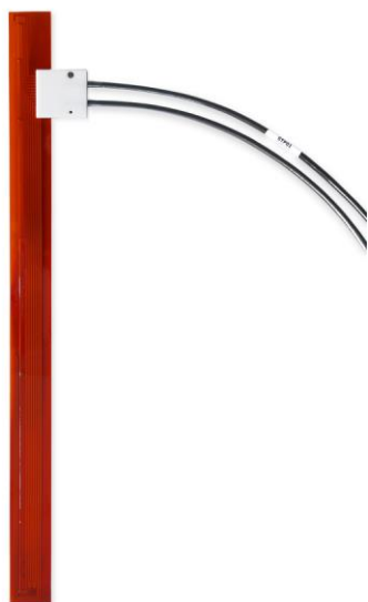
Figure 1 STP01 soil temperature profile sensor is applied in many large scale networks.

STP01 accurately measures the temperature profile of the soil at 5 depths close to its surface. It is used for scientific grade surface energy balance measurements. The sensor is buried and usually cannot be taken to the laboratory for calibration. The on-line self-test using the incorporated heating wire offers a solution to verify STP01's measurement stability.