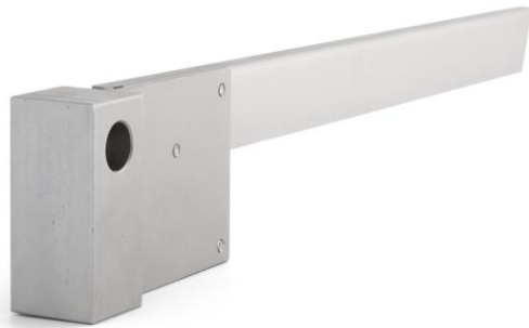
Figure 3 IT01 insertion tool is hammered down into the soil. After retracting it leaves a slit in which STP01 may be inserted

For ease of installation with a minimum of disturbance of the local soil, Hukseflux offers IT01 insertion tool.