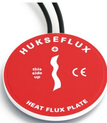
Figure 4 STP01 is often used in combination with HFP01SC self-calibrating heat flux sensor, shown in the picture