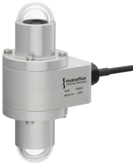
Figure 1 SRA01 second class albedometer

SRA01 albedometer is an instrument that measures global and reflected solar radiation and the solar albedo, or solar reflectance. It is composed of two identical second class pyranometers with thermopile sensors, the upfacing one measuring global solar radiation, the downfacing one measuring reflected solar radiation. SRA01 complies with the latest ISO and WMO standards.