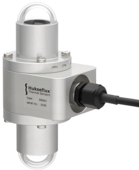
Figure 3 SRA01 second class albedometer, designed to fit a 3/4 inch NPS mounting tube

SRA01 consists of two identical pyranometers model SR01, one facing up, one facing down. The albedometer body is designed to fit a 3/4 inch NPS tube for mounting purposes. The cable can be led away through the tube (the tube's recommended outer diameter is < 28 \times 10^{-3} m, the inner diameter > 20 \times 10^{-3} m). Such a mounting tube is not part of the delivery. SRA01 can be ordered with longer cable and optional sun screens.