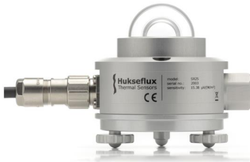
Figure 3 SR25 pyranometer with its sun screen removed

SR25 measures the solar radiation received by a plane surface, in W/m^2 , from a 180^\circ field of view angle. SR25 offers the best measurement accuracy: the specification limits of two major sources of measurement uncertainty have been greatly improved over competing pyranometers: "zero offset a" and temperature response.