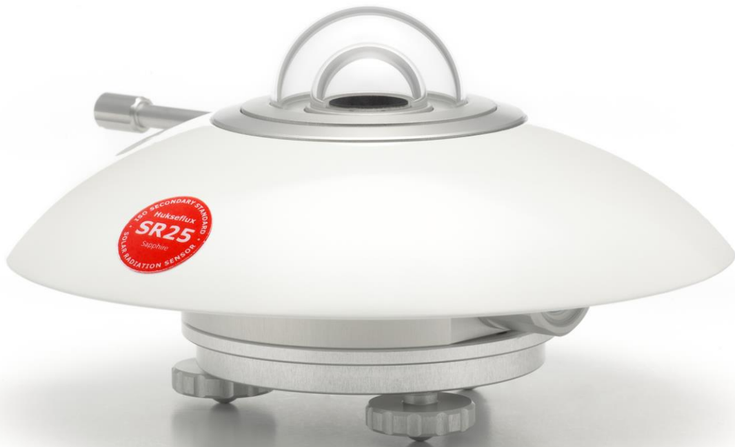
Figure 1 SR25 secondary standard pyranometer

SR25 takes solar radiation measurement to the next level. Using a sapphire outer dome, it has negligible zero offsets. SR25 is heated in order to suppress dew and frost deposition, maintaining its measurement accuracy. When heating SR25, the data availability and accuracy are higher than when ventilating traditional pyranometers. SR25 needs very low power. Patents on the SR25 working principle are pending.