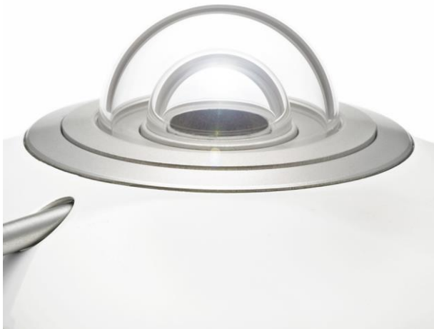
Figure 6 SR25's sapphire outer dome takes solar radiation measurement to the next level