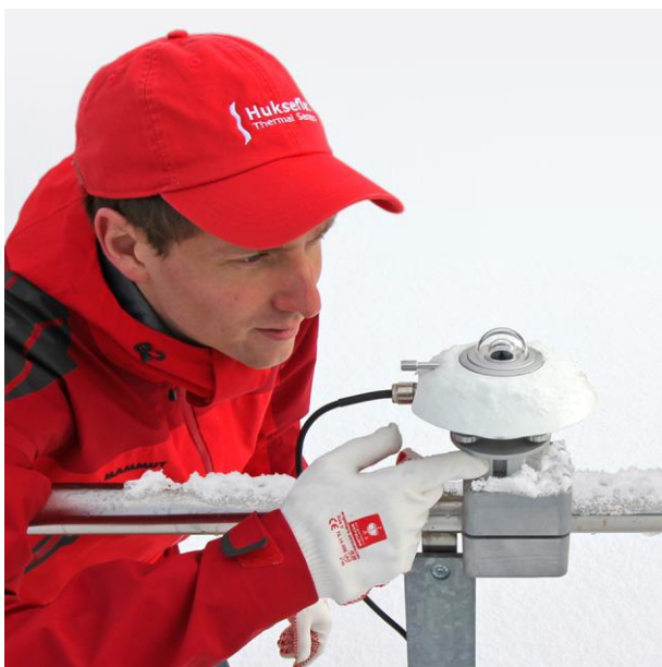
Figure 4 SR25 accelerating sublimation of snow, here shortly after snowfall

SR25 has a sapphire outer dome, glass inner dome and an internal heater. It employs a state-of-the-art thermopile sensor with black coated surface and an anodised aluminium body. The connector, desiccant holder and sun screen fixation are very robust and designed for long term use.