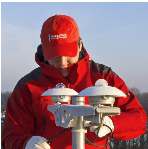
Figure 2 frost deposition: clear difference between SR25 (left), versus a non-heated pyranometer without sapphire dome (right)