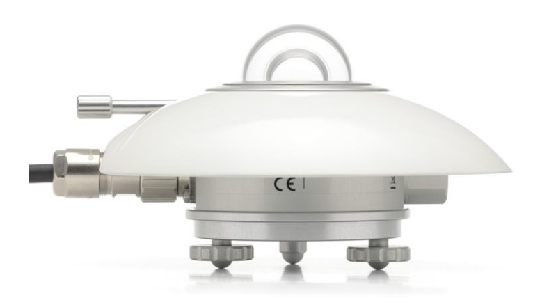
Figure 1 SR20 secondary standard pyranometer