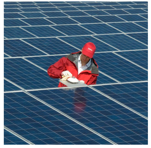
Figure 2 accurate PV system performance monitoring