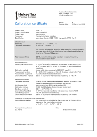
Figure 4 Hukseflux product and calibration certificates