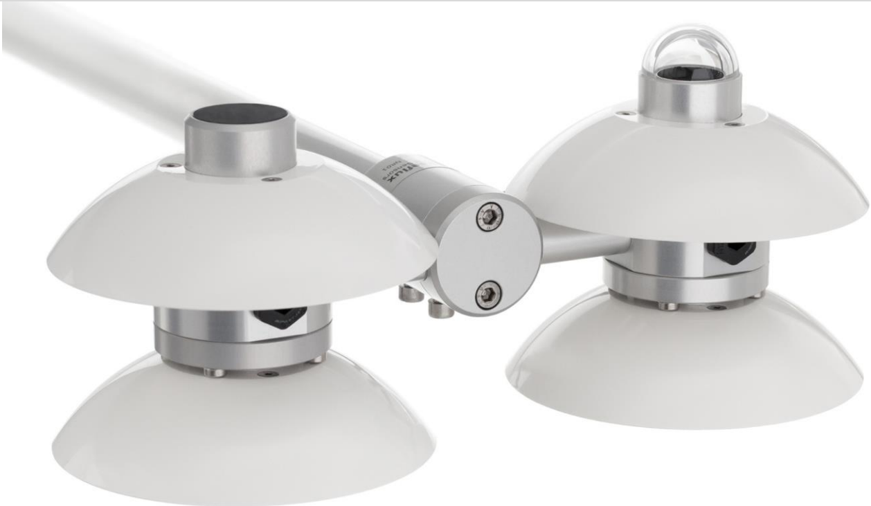
Figure 1 NR01 4-component net radiometer

NR01 is a market leading 4-component net radiation sensor, mostly used in scientific-grade energy balance and surface flux studies. It offers 4 separate measurements of global and reflected solar and downwelling and upwelling longwave radiation, using 2 sensors facing up and 2 facing down. NR01 owes its popularity to its excellent price / performance ratio. Advantages include its modular design with 2 pairs of identical sensors, low weight, ease of levelling, and low solar offsets in the longwave measurement. The unique capability to heat the pyrgometers reduces measurement errors caused by dew deposition.