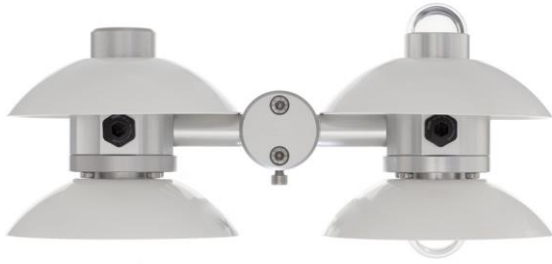
Figure 4 NR01 4-component net radiometer, including two pyranometers, two pyrgeometers, heater and 2-axis levelling assembly (mounting tube not included)