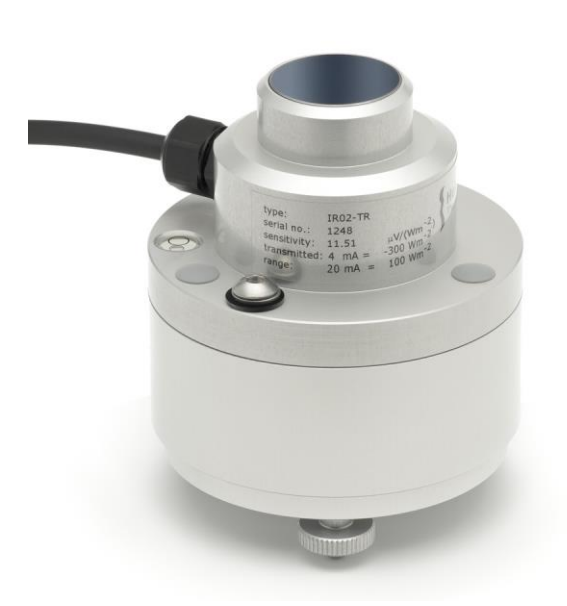
Figure 1 IR02-TR pyrgeometer with heater and 4-20 mA transmitter

IR02-TR is a pyrgeometer suitable for longwave irradiance measurement in meteorological applications. The instrument can be heated, which improves measurement accuracy as it prevents dew deposition on its window. IR02-TR houses a 4-20 mA transmitter for easy read-out by dataloggers commonly used in the industry.