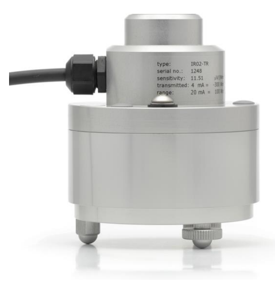
Figure 3 IR02-TR with heater and 4-20 mA transmitter