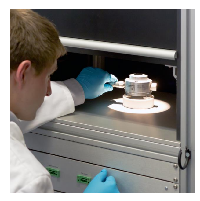
Figure 4 pyrgeometer during conformity assessment

Calibration of pyrgeometers used for downward longwave radiation is traceable to the World Infrared Standard Group (WISG). This calibration takes into account the spectral properties of downward longwave radiation. As an option, calibration can be made traceable to a blackbody and the International Temperature Scale of 1990 (ITS-90). This alternative calibration is appropriate for measurements of upward longwave radiation (with IRO2 pyrgeometers facing down).