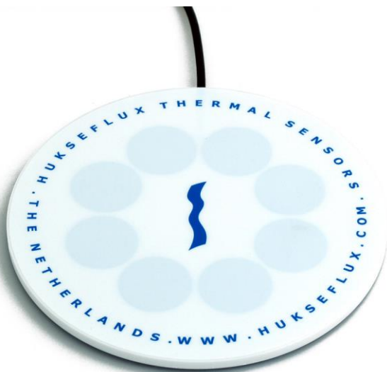
Figure 1 HFP03 ultra sensitive heat flux plate

HFP03 is an ultra sensitive sensor for measurement of small heat fluxes in the soil as well as through walls and building envelopes. The total thermal resistance is kept small by using a ceramics-plastic composite body. See also model HFP01: putting several HFP01 sensors electrically in series is an alternative for using HFP03.