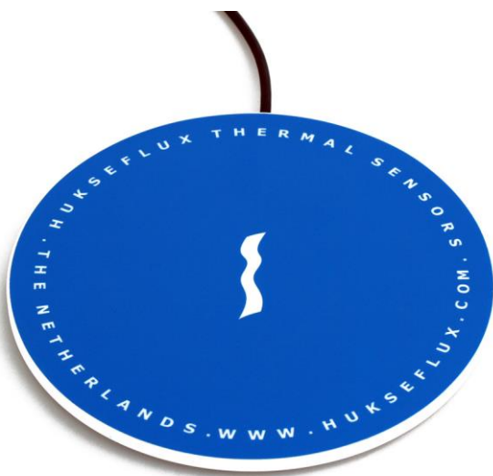
Figure 2 opposite side of HFP03, which has a blue coloured cover