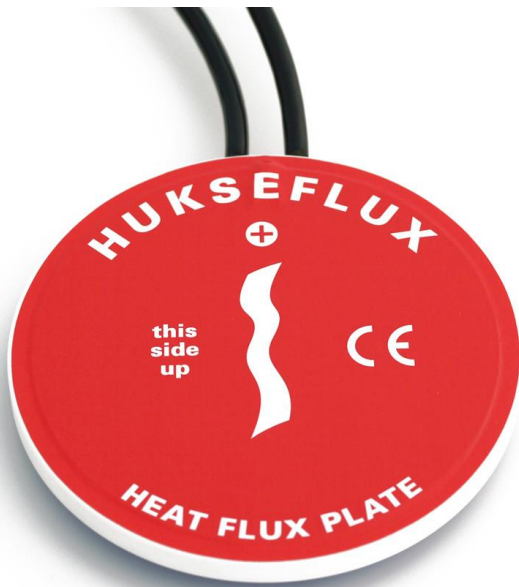
Figure 1 HFP01SC self-calibrating heat flux sensor. The opposite side has a blue coloured cover.

HFP01SC self-calibrating heat flux sensor™ is a heat flux sensor for use in the soil. It offers the best available accuracy and quality assurance of the measurement. The on-line self-test verifies the stable performance and good thermal contact of sensors that are buried and cannot be visually inspected and taken to the laboratory for recalibration. The self-test also includes self-calibration which compensates for measurement errors caused by the thermal conductivity of the surrounding soil (which varies with soil moisture content), for sensor non-stability and for temperature dependence.