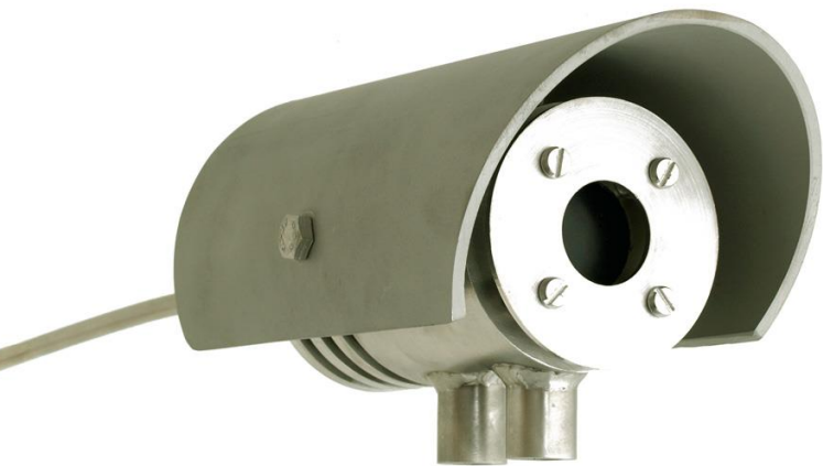
Figure 1 HF02 flare radiation monitor / heat flux sensor

HF02 is a sensor that measures radiant heat flux or thermal radiation in the outdoor environment. A common application is monitoring the radiation emitted by flares. HF02 is certified for use in potentially explosive atmospheres, and is rated for radiation levels up to 15 \times 10^3 \text{ W/m}^2 . We recommend use of HF02 in a decision-supporting role only, and not to use measurements of HF02 as the main or sole source of information for judging safety.