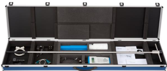
Figure 5 The complete FTN02 system: FTN02 includes one spare sensor TP09, adapters for charging the system in the office, WSA02, and in an automobile, CA02. Also included are communication software and a jar for glycerol. Glycerol must be purchased locally.