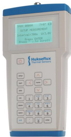
Figure 4 FTN02: CRU02 control and read out unit