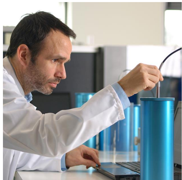
Figure 2 Performing measurements for customers in Hukseflux material characterisation laboratory: using calibration reference cylinders for traceability