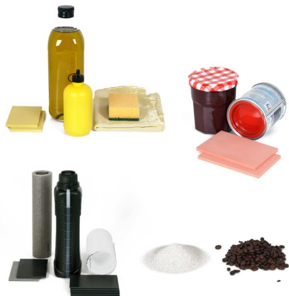
Figure 1 Common material types are plastics, soils, paints, composites, pastes, powders, fluids and foodstuff

Highlighted in this brochure are our material characterisation laboratory, custom-made instrument design and customer-specific experiments.