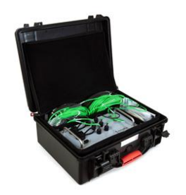
TRSYS01 High accuracy thermal resistance measurement system with 2 measurement locations