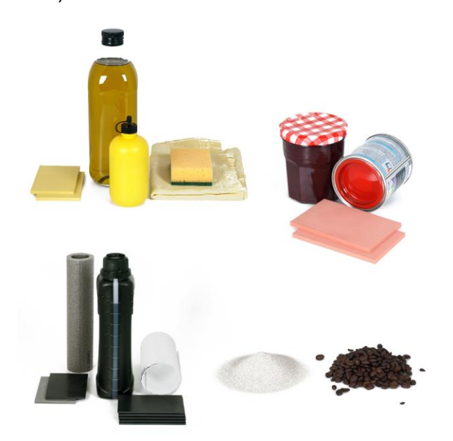
Figure 2 Example of materials of which thermal properties can be determined with Hukseflux measuring systems and sensors: common samples are plastics, paints, composites, pastes and fluids